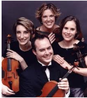
Fry Street Quartet

**Registration information and forms will be available at www.utahasta.com soon!**