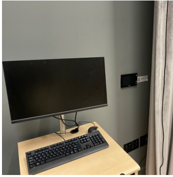
Wall panel for projector